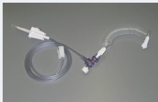
The Injection Set allows injecting and rinsing the syringe and the line.

The environment and the traceability are in line with the standards of the pharmaceutical industry.